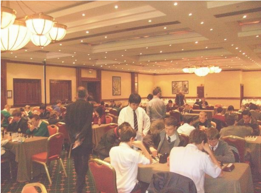
Playing room at the Carlton Hotel in Castletroy