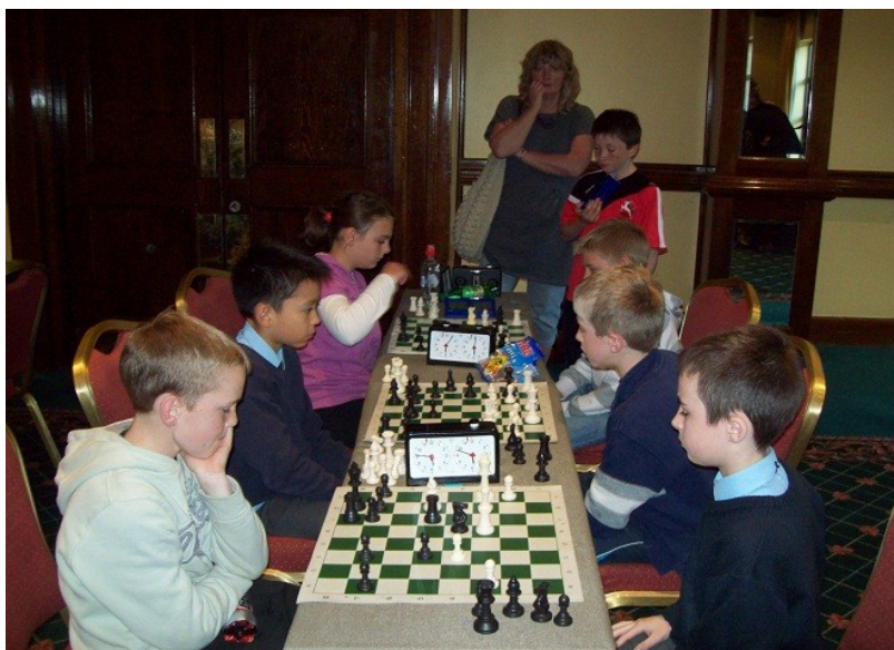
Boards 1 to 3