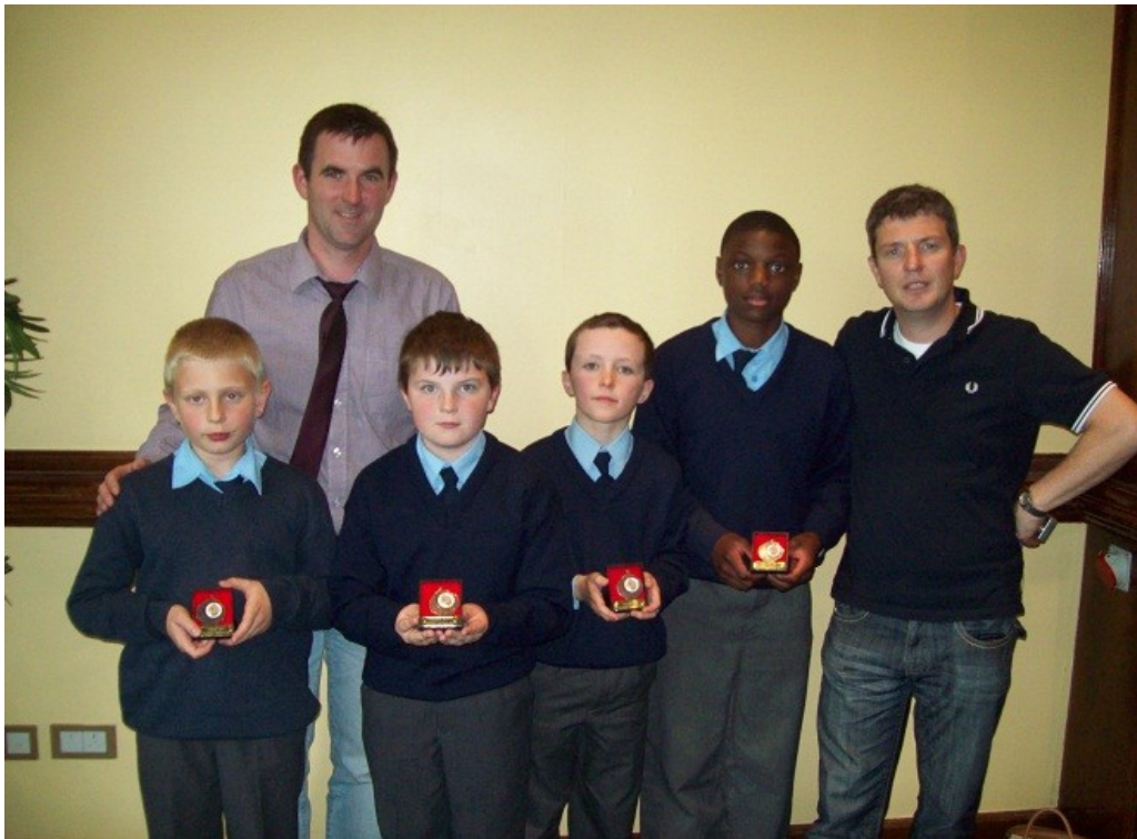
Joint 3 rd team: St Pats de la Salle-B, Castlebar, Co Mayo