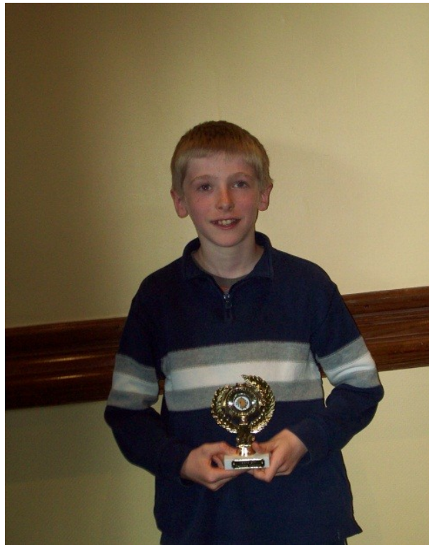
Irish CheckMate Champion, 2011