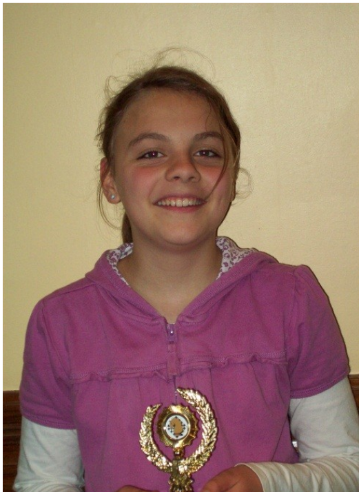
2 nd placed Individual