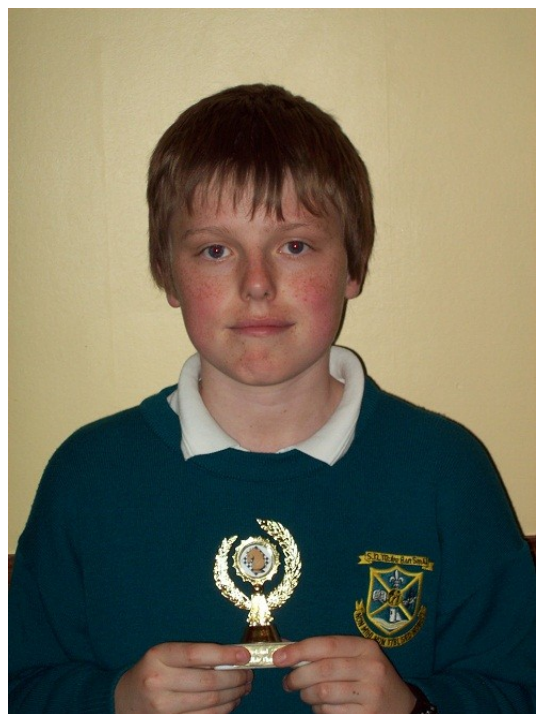
3 rd placed Individual