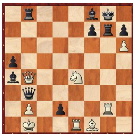
White to play

In July Fun Zone we prepared 4 Mate in 3 positions. Enjoy!