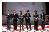
BILBAO MASTERS 2016