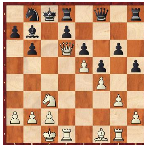
White to play