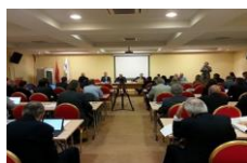
ECU GENERAL ASSEMBLY 2016