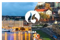
EUROPEAN UNIVERSITIES CHESS GAMES 2016